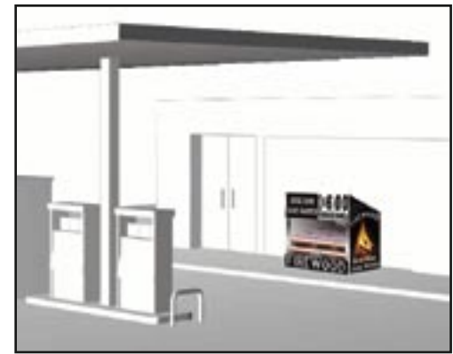
Excellent outdoor profit opportunity!