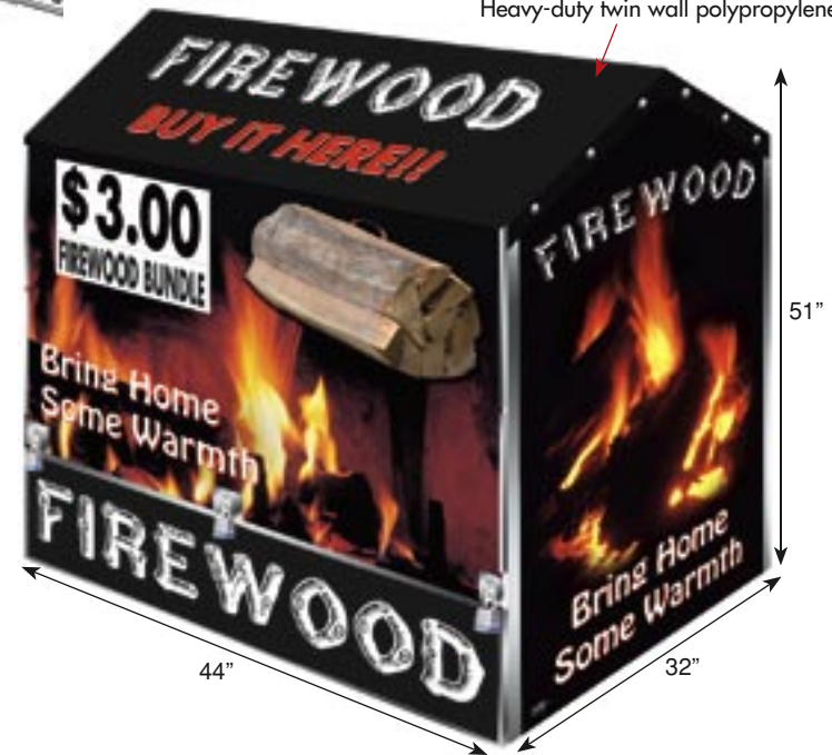
Heavy-duty twin wall polypropylene

INTERMARKET TECHNOLOGY, INC. THE LEADER IN PRECISION DESIGNED DISPLAY EQUIPMENT (973) 872-9090 • (800) 859-0803 • Fax (973) 872-9010