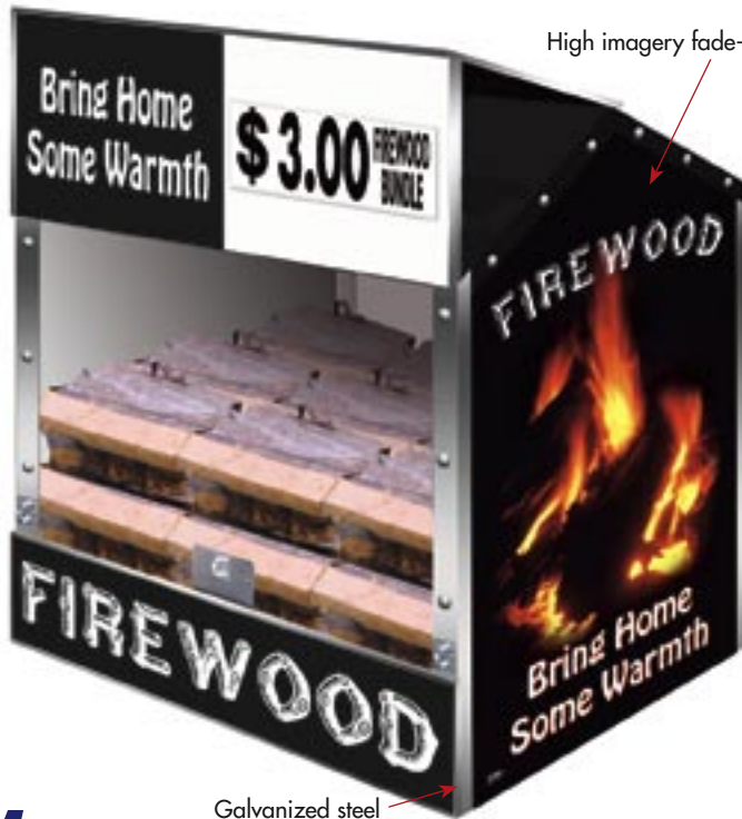
High imagery fade-proof graphics